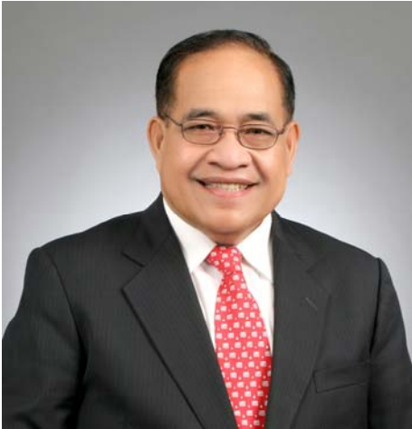
Governor Benigno R. Fitial