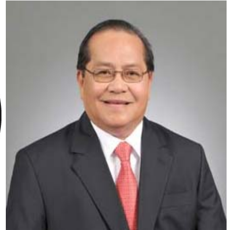
Lt. Governor Eloy S. Inos